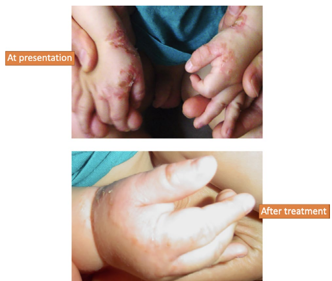
FIGURE 2 Case 2 presentation and treatment result

Pemphigus vulgaris—while the lesions were extensive, the mucous membranes were not affected as happens in