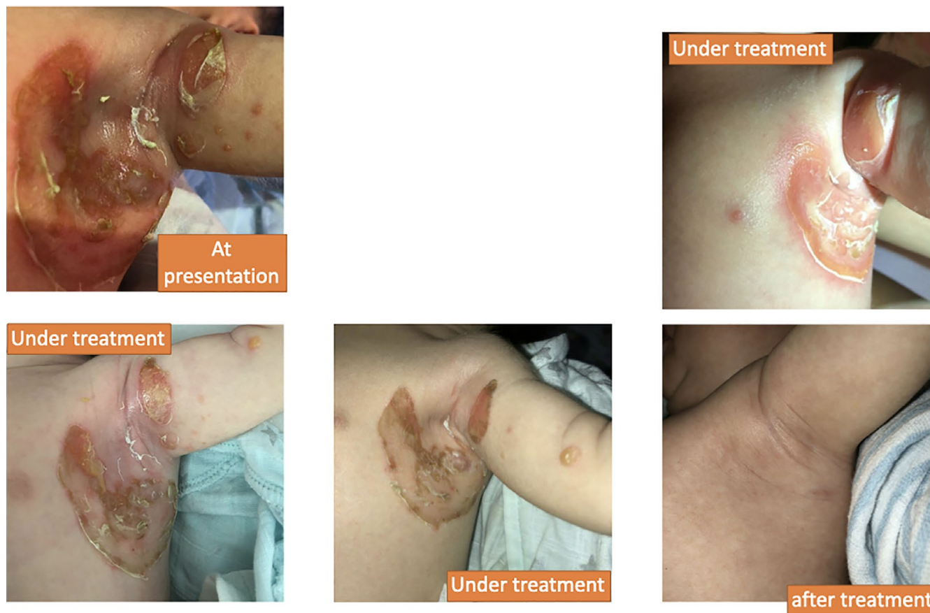
FIGURE 4 Case 4 presentation and treatment result

immediate introduction of intravenous antibiotics for sepsis prevention was recommended. No immunofluorescence investigation was conducted, which would have been desirable to confirm diagnosis.