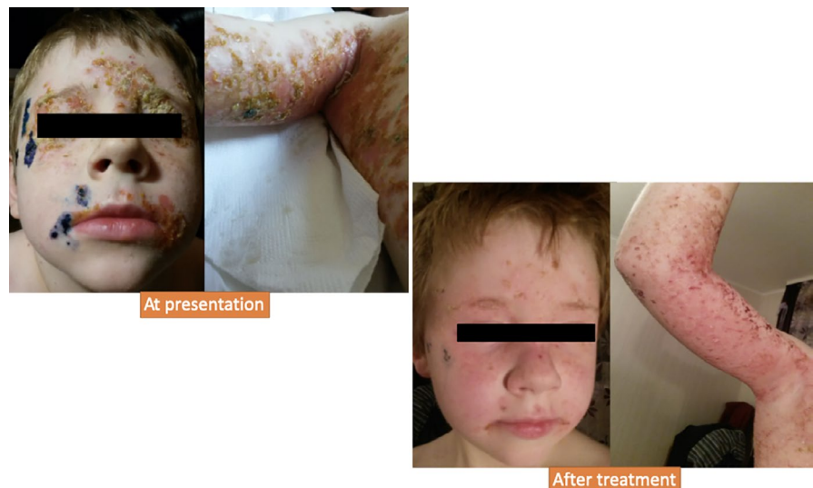
FIGURE 3 Case 3 presentation and treatment result

Diagnosis: In the hospital, the patient was diagnosed clinically with “bullous pemphigoid neonatorum” (BP), and